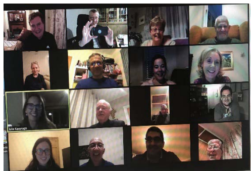
Members of the Diocesan Pastoral Council on a Zoom Meeting with Bishop Denis

As we continue to adjust to the norms of social distancing and restrictions, parishes and diocesan groups are establishing new ways of 'meeting'. Parish teams and a number of Parish Pastoral Councils are now meeting via zoom conference calls or video calls, or via other platforms.